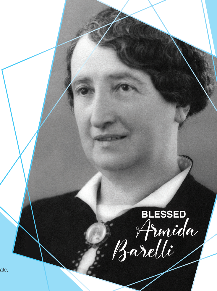
BLESSED Armida Barelli